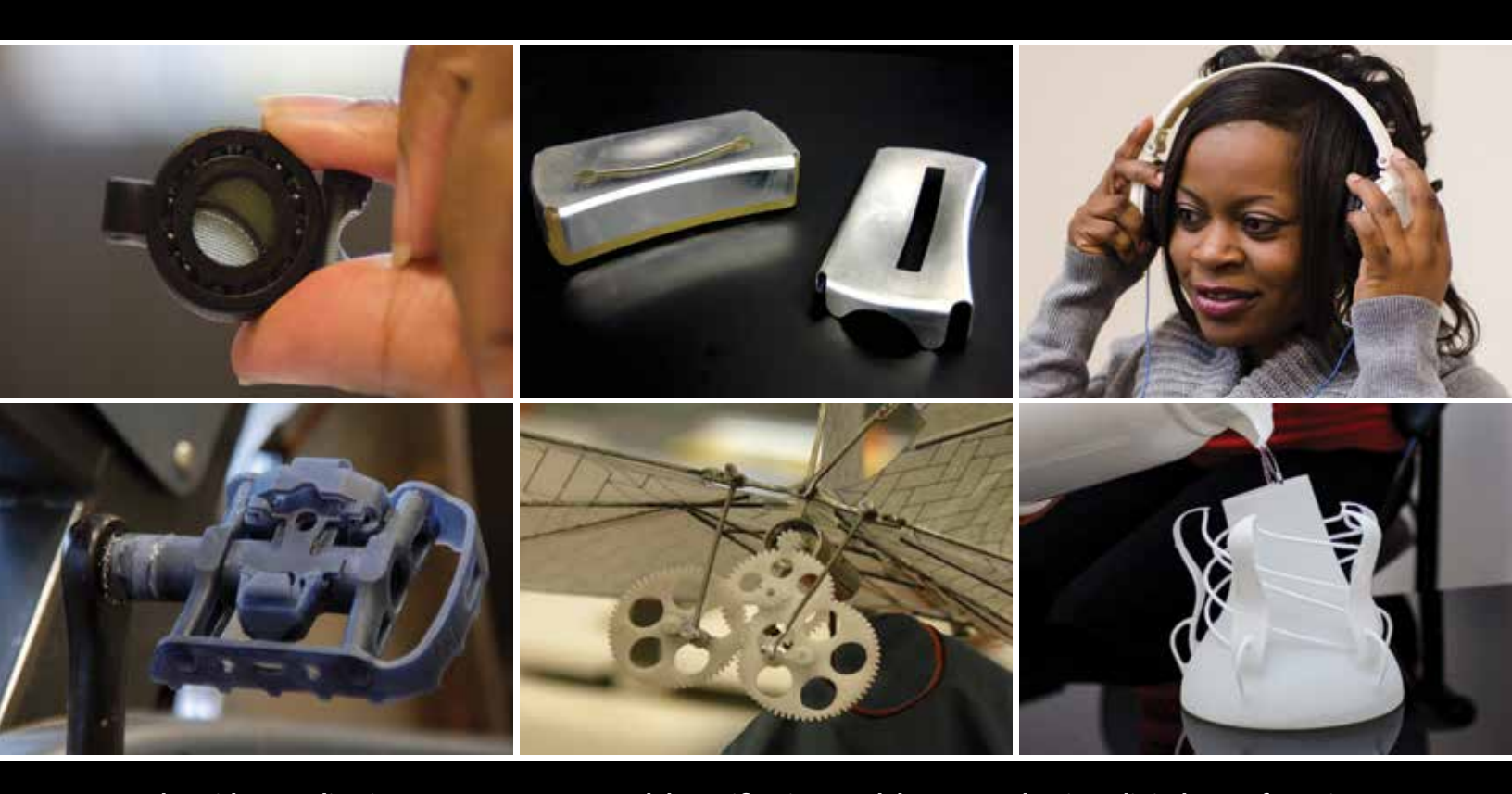
The widest applications range: concept models, verification models, pre-production, digital manufacturing