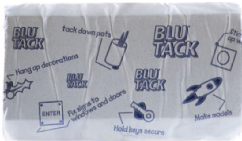
PLASTIC REUSABLE ADHESIVE (PUTTY) BLU TACK