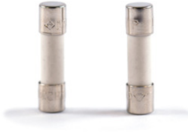
FUSE (2 spare pcs.)