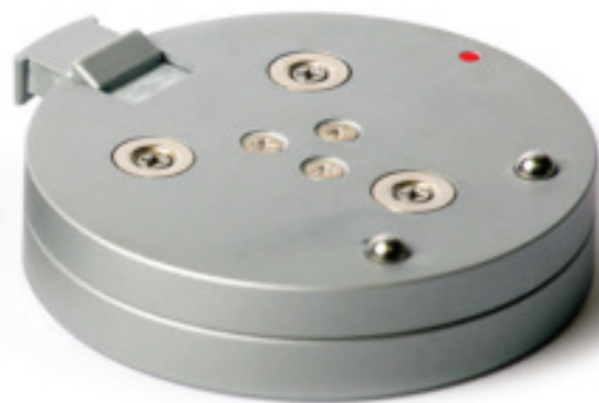
SPACER (2 pcs.)