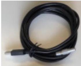
4070.0340.001 3 m USB CABLE 10/75/100HSX