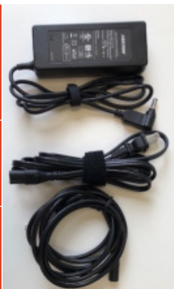
4070.0331.001 POWER CABLE, 10HSX