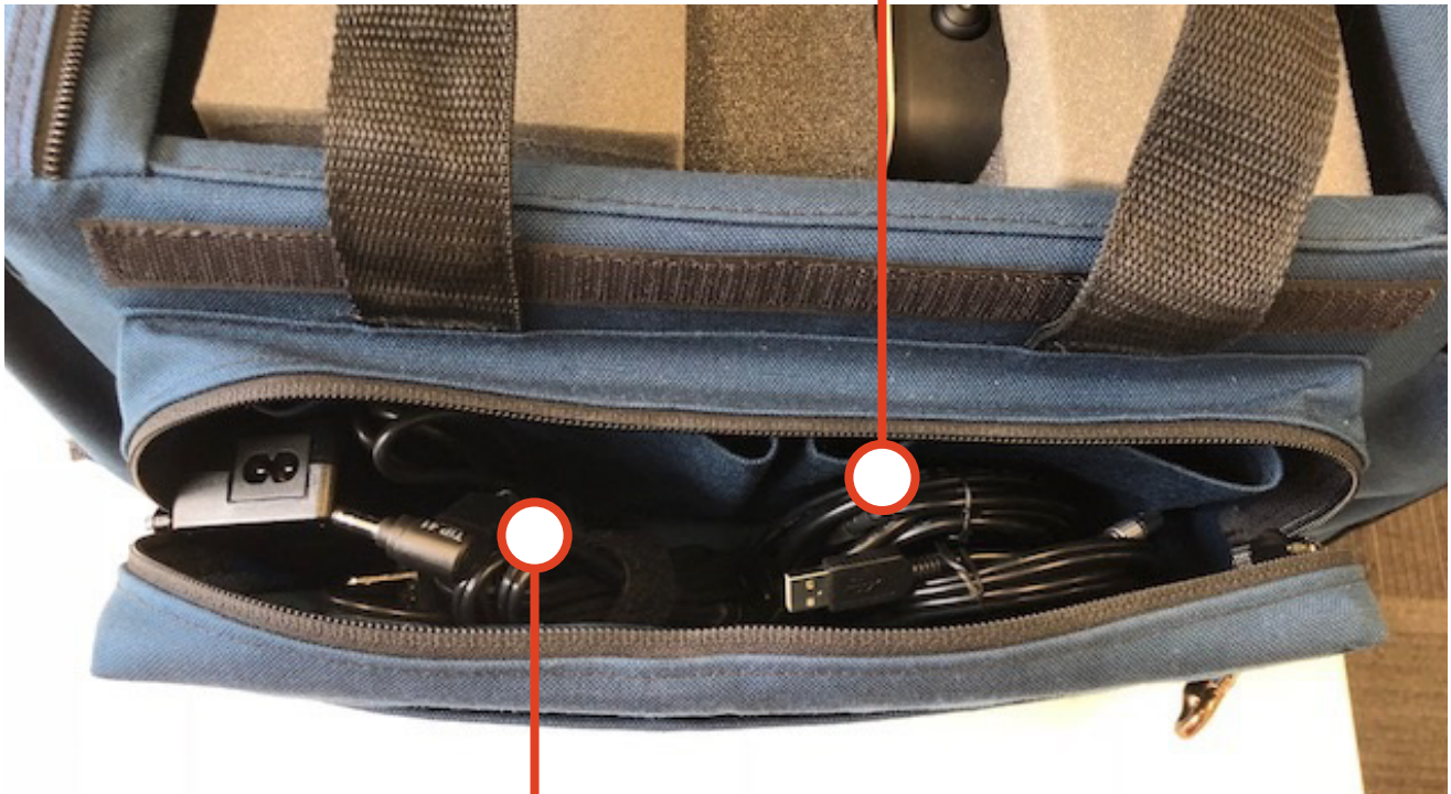
7010.0205.014 DC POWER SUPPLY 15-20 V, 5 A, 2.5 mm TIP